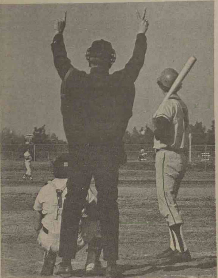
Umpire gives 1-2 count against opposing batter in one of last week's games.