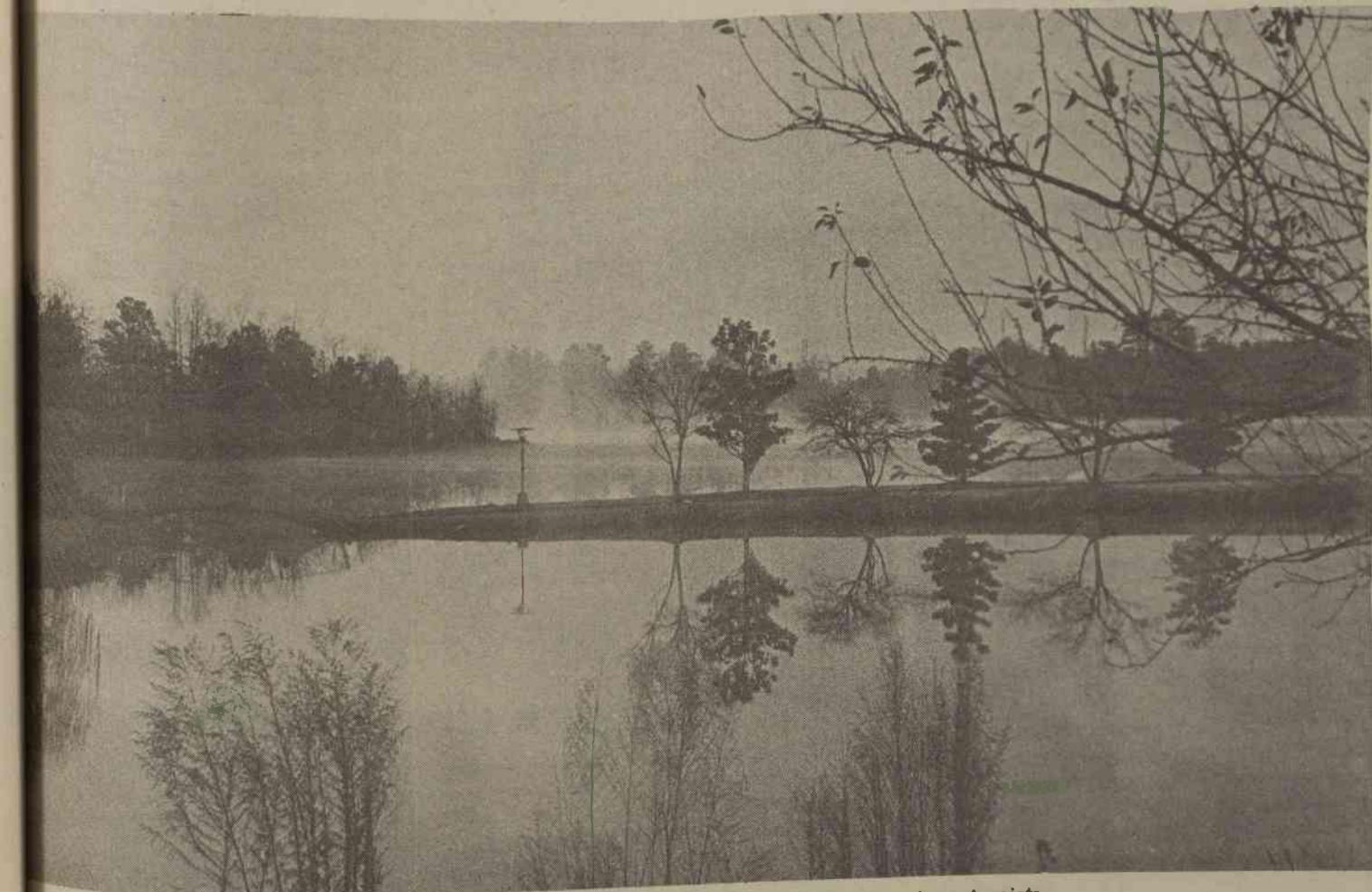
A QUICK glimpse of Lake Moore in early morning: A misty reminder of spring.