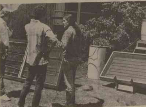
Now these look more like solar panels, to us anyway. The display of solar technology was held yesterday in the Liberal Arts Courtyard.