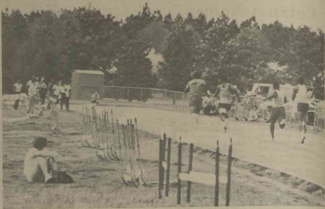
Lamp & Shield Staff