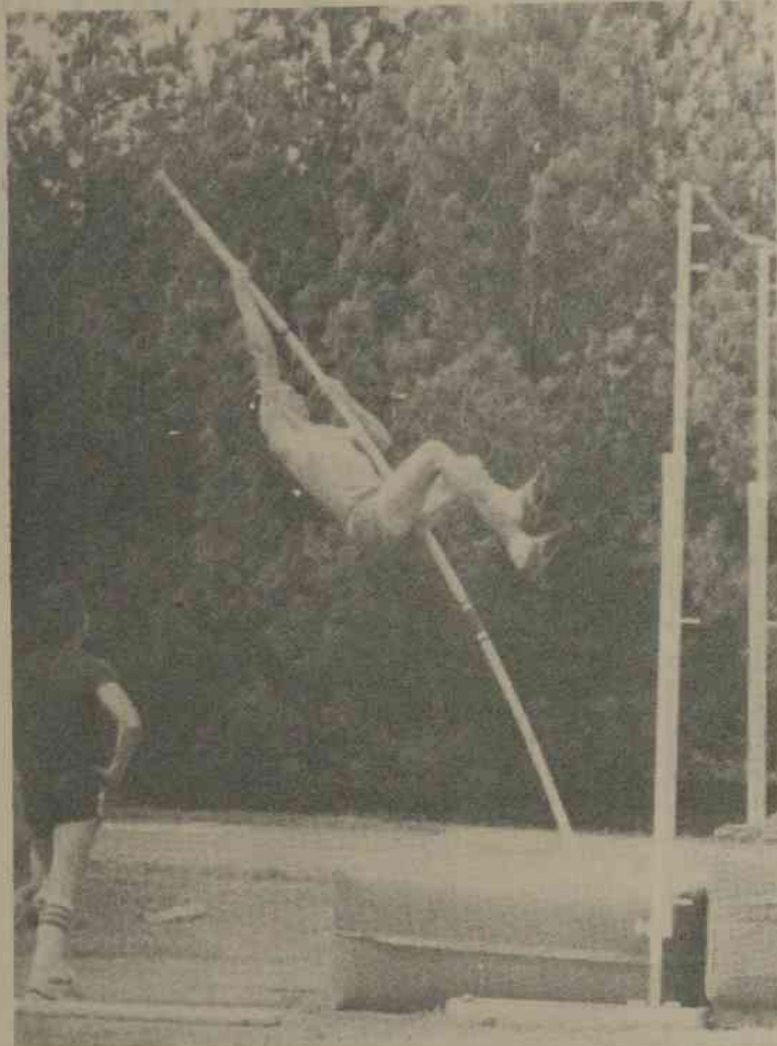
Lamp & Shield Staff