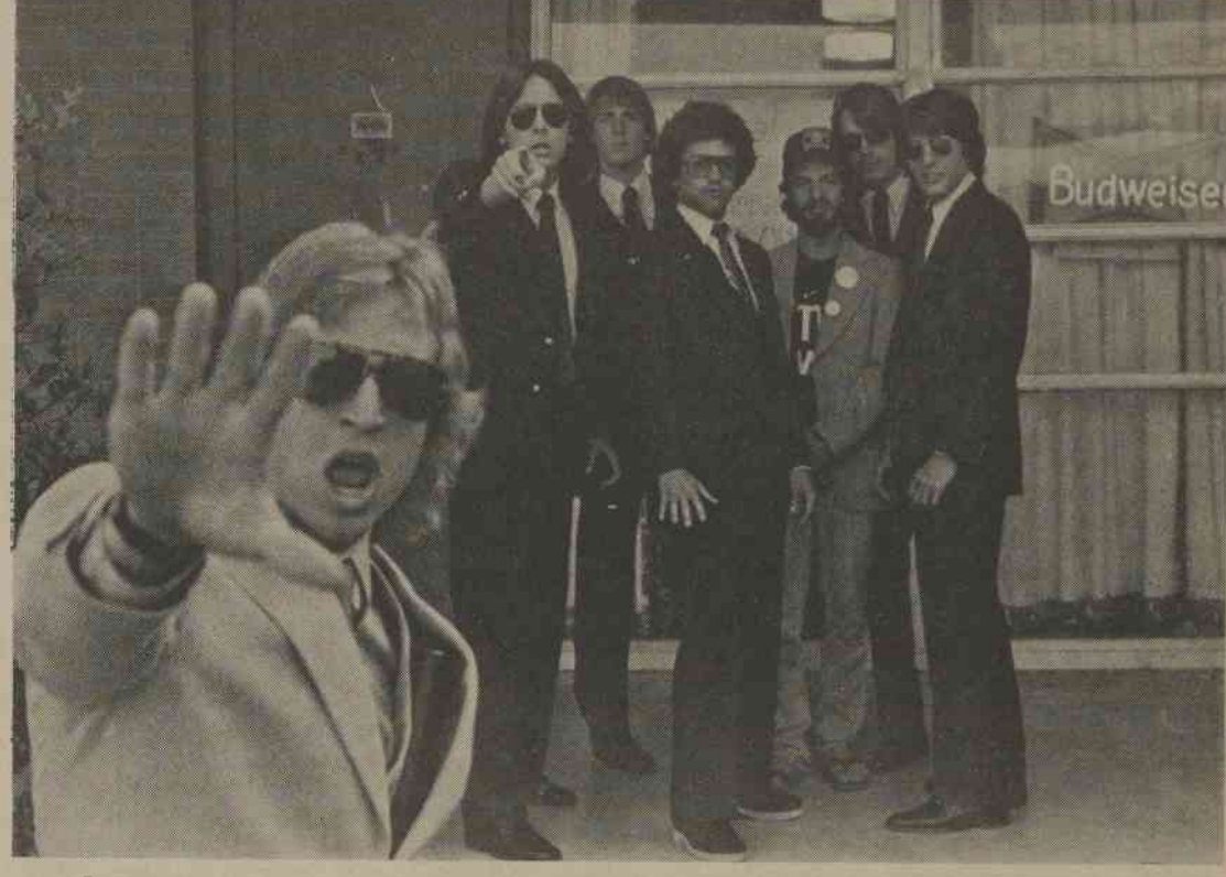
DOSAL was fortunate to have survived an assassination attempt last Spring during election campaigns.