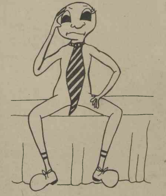
And I thought the Liberal Arts Symposium supposed to enlighten me.