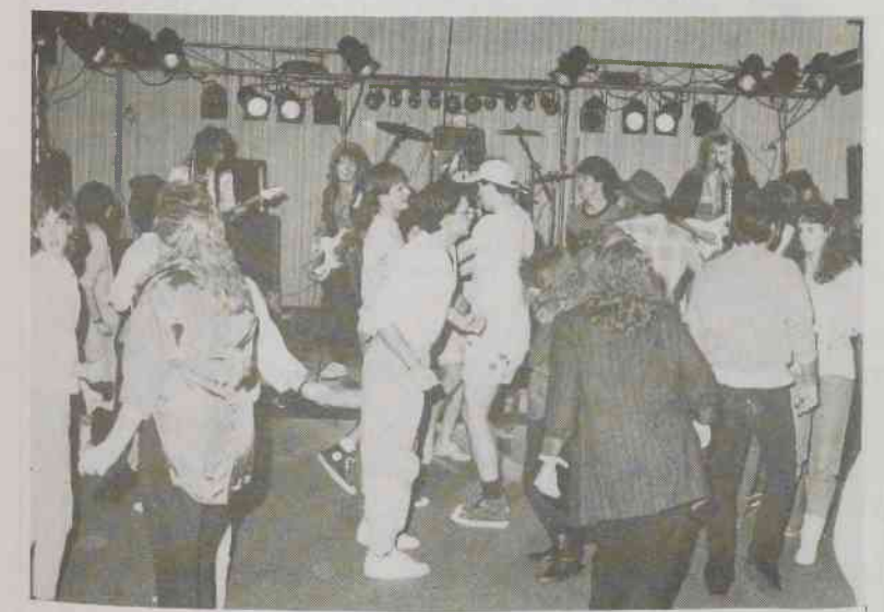
For the past few months the band has been laying tracks for their first single "Goodbye," a one-sided 45, which should be released any day now. The song is slow and mellow, perfect for dancing, with just enough percussion, bass and whining guitar to make it a good rock tune. The band has promised to keep in touch with St. Andrews which it considers one of its best audiences ever.

band to the Ramada Inn in Lumberton two weeks later for another high-powered performance.