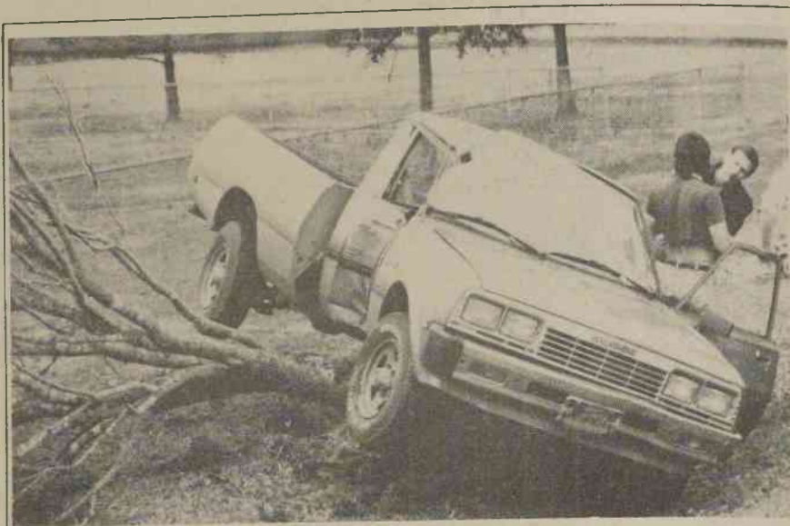
State-of-the-art, high tech parking spaces recently installed (below) (Above) Maintenance worker demonstrates correct parking procedure

Students reacted with a mixture of shock and surprise last week when two of the schools major problems were remedied at the same time.