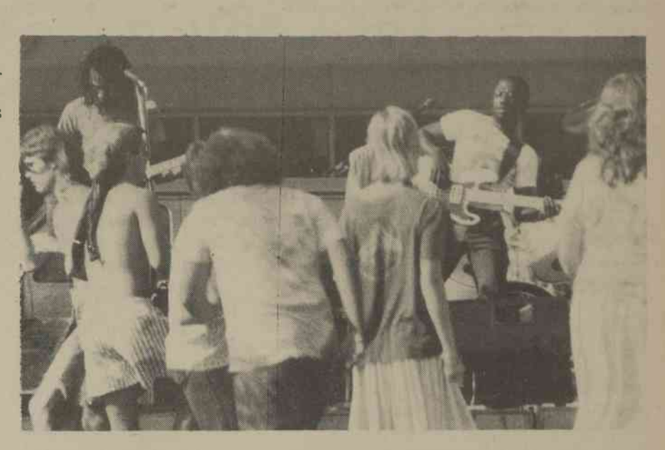
Reggae band Peace of Mind jammed at Blue-White while students moved to their sound.

Darin Lawrence and the East Coast Blue Grass Band closed out the celebration of Blue-White.