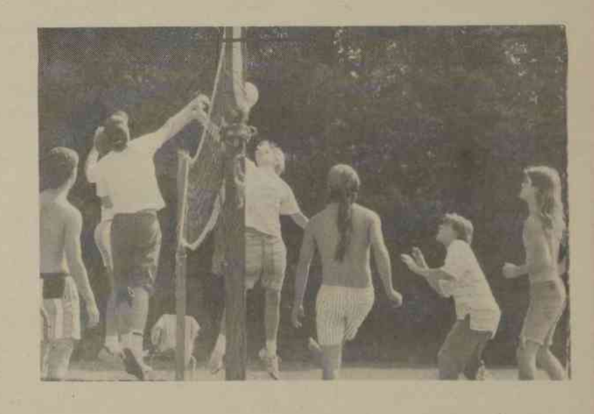
Volley ball competition, one of several events, took place off of Granville Beach