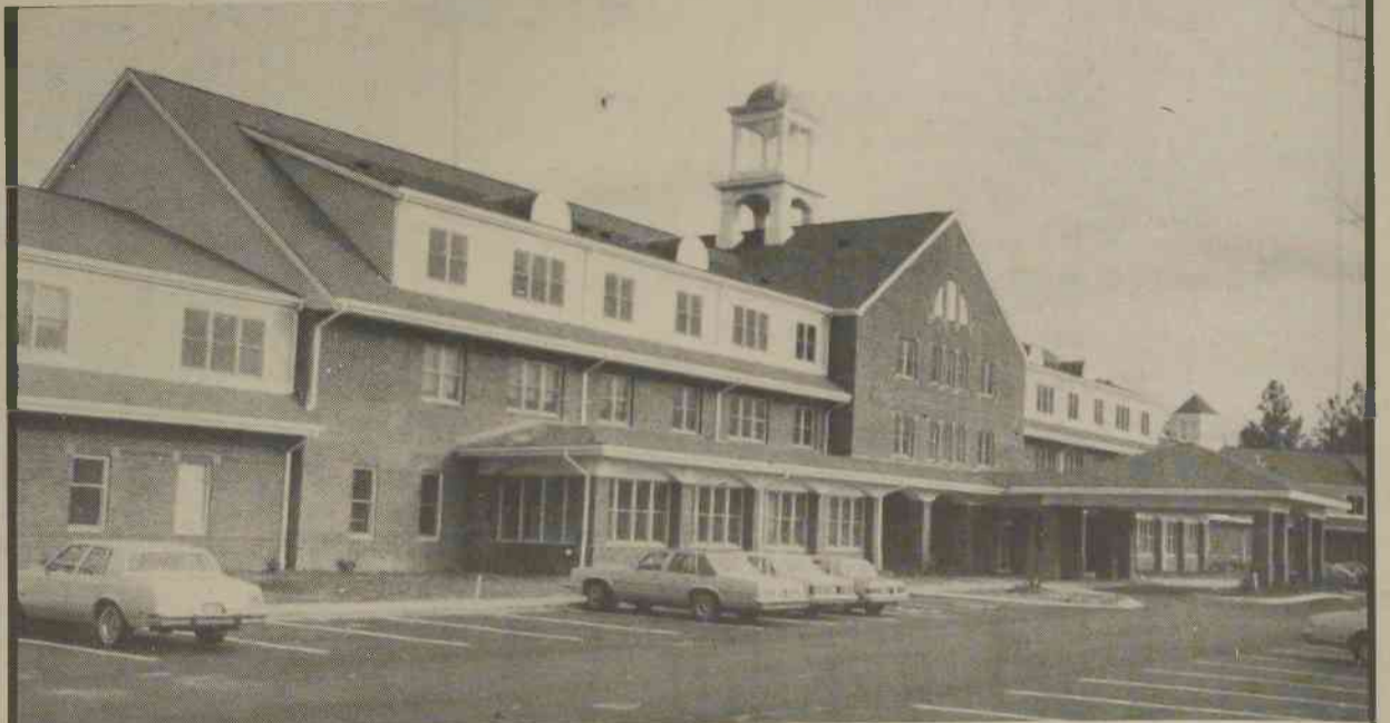
The newly constructed "Chez Granville" will be opening its doors April 10.

Contact SwampRat Tours of Laurinburg For the Bobsled- ding Experience of your Life!