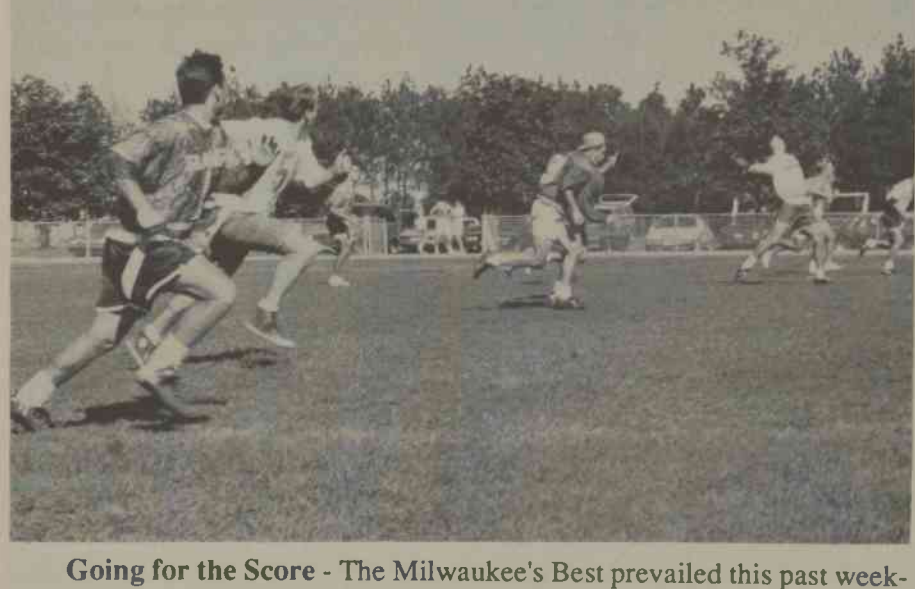
end of intramural football.