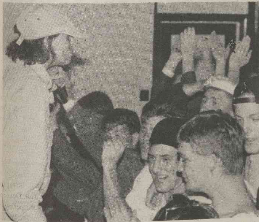
A member of the Lovely Ladies of Concord rouses the crowd into a joyous excitement, during the groups turn on stage. The ladies finished third during the competition.

The St. Andrews' baseball team sponsored its 6th Annual Airband two weeks ago in Farrago. The event, which is held every year at this time, soon turned the night into a roaring goodtime.