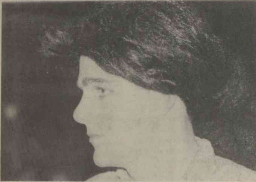
Look at this, "who's the hot, new chick on campus? I wonder what she does for a living?"