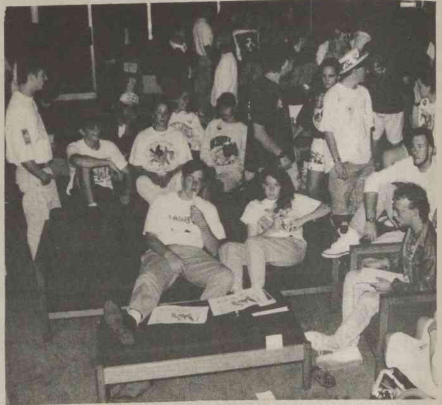
The Gathering place was packed on Tuesday November 3, to view history in the making, as onlookers witnessed the defeat of the Republican President George Bush.