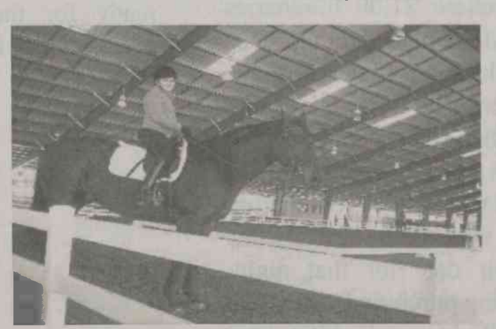
(Waiting for instruction.)