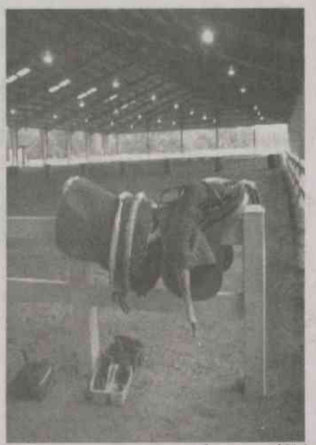
(Preparing to saddle.)

The Therapeutic Horsemanship program hosted an EFMHA workshop; individuals came across the state for the three day event. The Equine Facilatated Mental Health Association encourages education and individual interaction with the horse in the treatment of individuals with emotional, behavioral, social, mental, physical and/or spiritual needs. Throughout the three days, lectures were given about how instructors can encourage riders and there were labs that helped participants see the difference in communication between instructors, riders and horses as well.