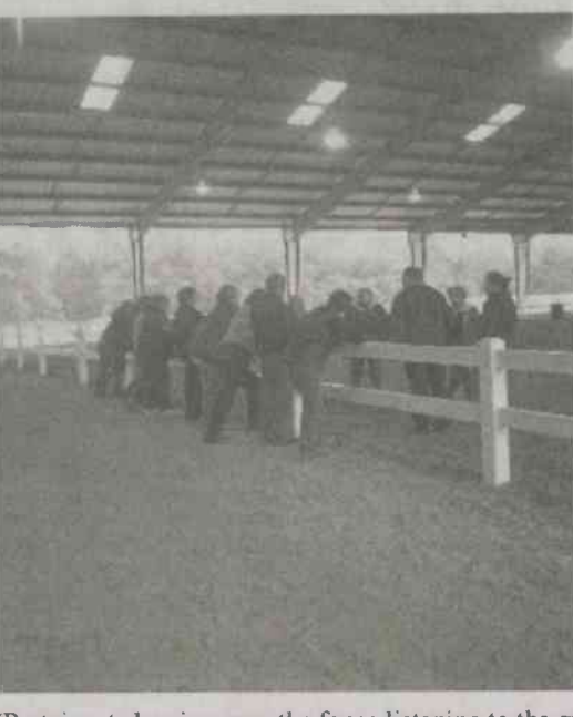
(Partcipants leaning over the fence listening to the guest speaker.)