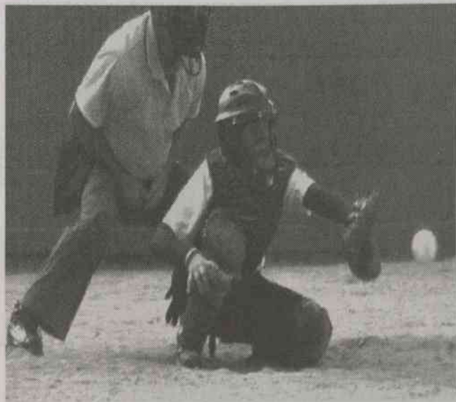
(Catching the pitch. Picture Courtesy of Rooney Coffman)