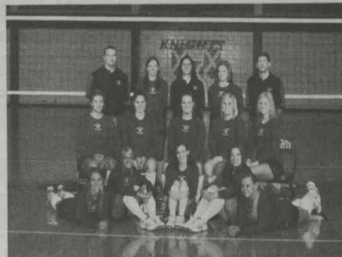
(2006 Volleyball Team.)