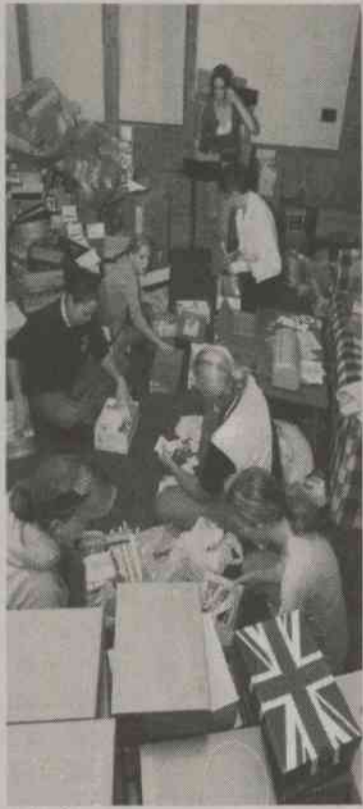
St. Andrews Equestrians gather to build toy boxes.