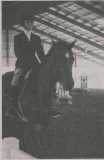
Woody getting his workout.

Registered name: Driftwood 16 hand bay Trakhener