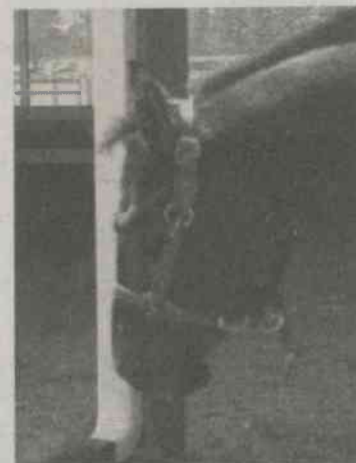
Pepper Looking around.

Pepper: Six-year old 15.3 Hand Dark Bay Quarter Horse Gelding