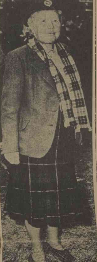
LADY MacLEOD