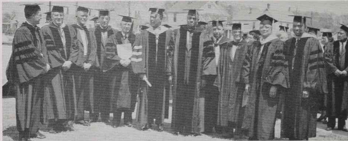
College Presidents Assemble for the Inauguration