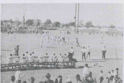
Action during Homecoming game in which the Fayetteville Broncos picked up four yards on a pitch-out from quarterback to halfback.

The Pirates of Elizabeth City State Teachers College staged a come-from-behind 7-6 victory over Fayetteville State Teachers College.