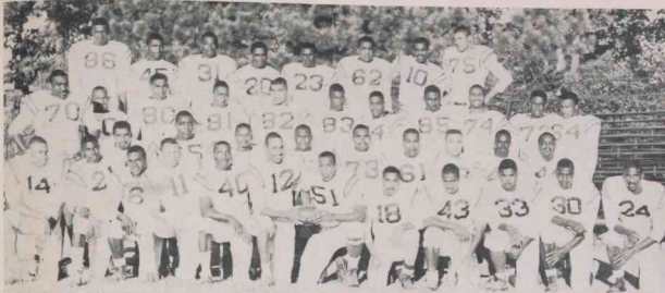
THE 1963 VIKINGS SQUAD