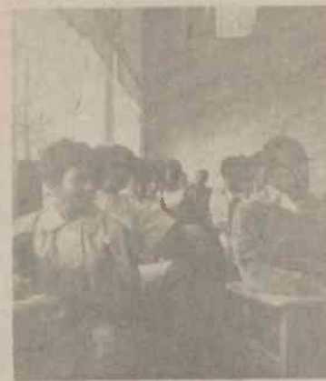
CLASS LISTENS ATTENTIVELY.