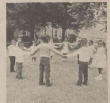
IT'S "RING AROUND THE ROSES" TIME FOR NURSERY SCHOOL.