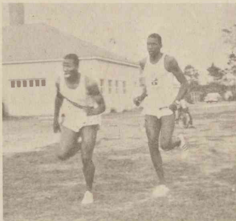
SINGLETON AND ALLEN—A PERFECT PASS IN THE 440 YD. RELAY.