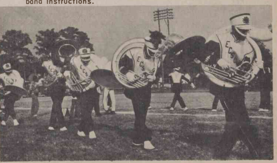
The Rocking Tubas