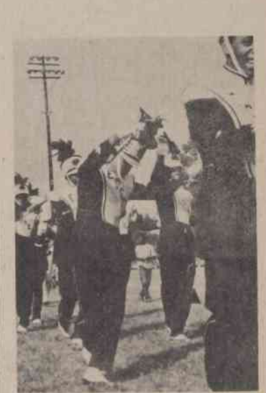
Band Rocks to the Drums.