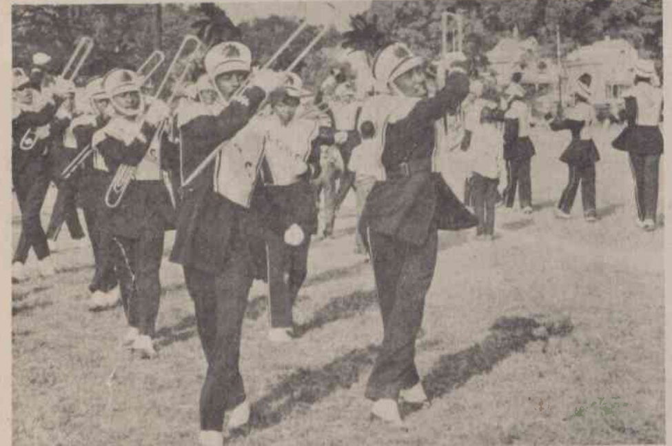
The "Vikings" Band are in the swing.