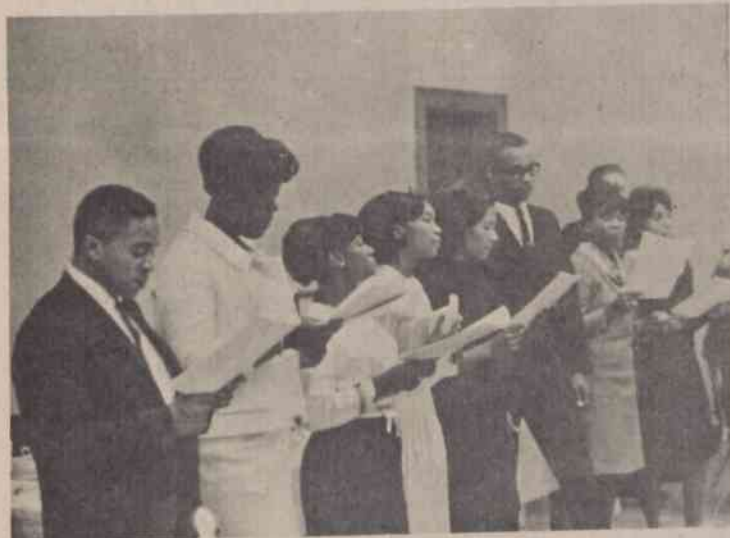
Student Leaders sing along with speaker