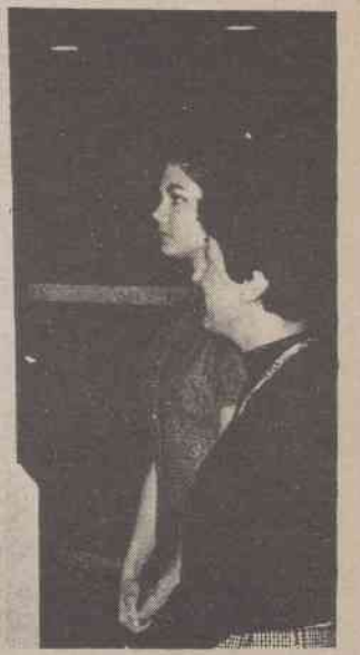
Two employees of Wachovia Bank admire paintings.