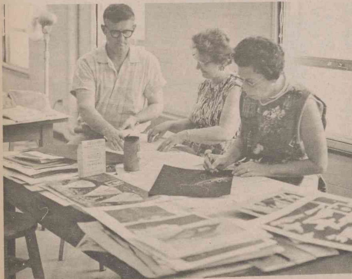
Diligent workers in art in the public school

and strengthen the overall services of the library.