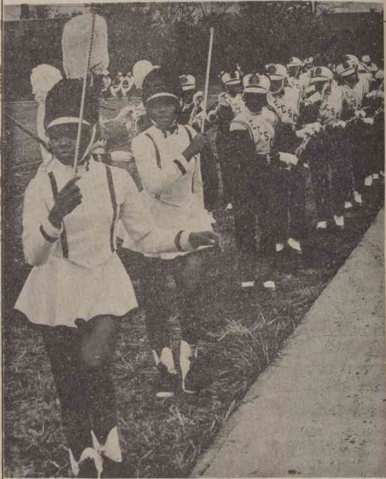
The Marching Band Performs