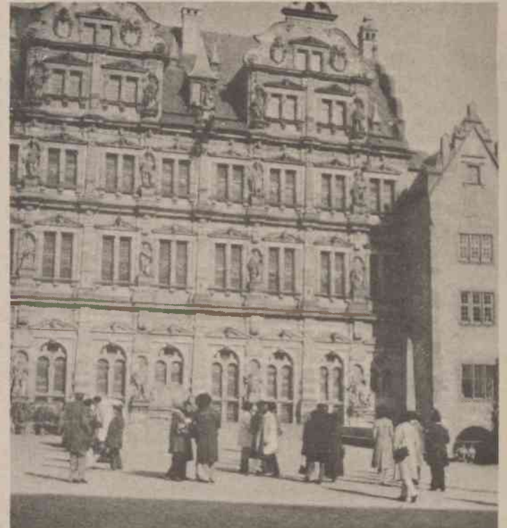
Students tour castle of Heidelberg in Germany, 12th century castle.