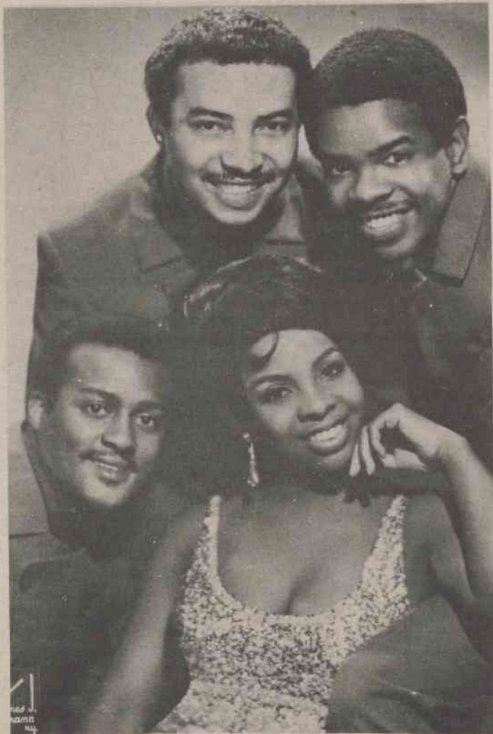
Gladys Knight And The Pips