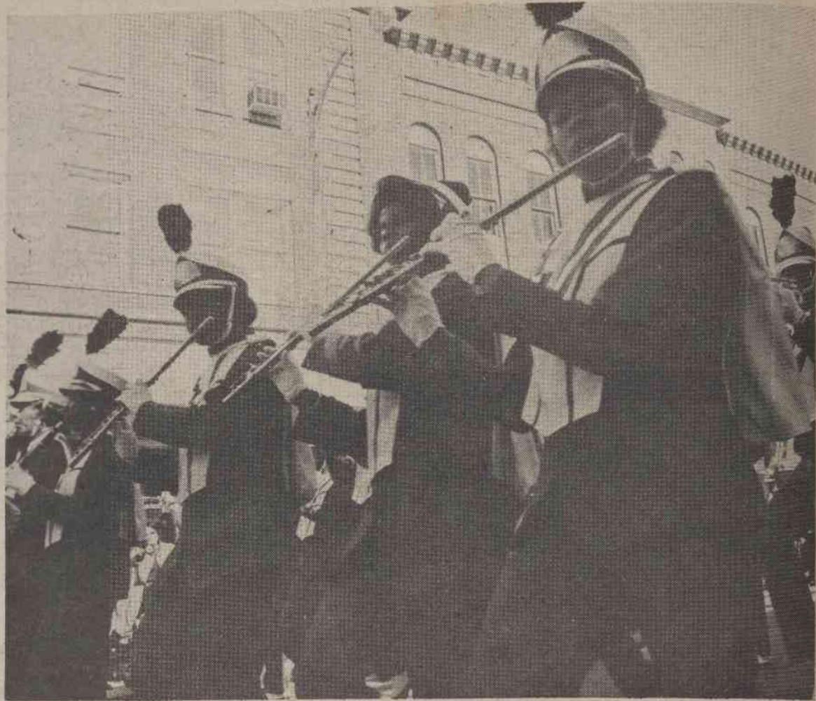
31. The Viking's own talent was presented during the Homecoming parade by the Marching Viking Band (upper right).