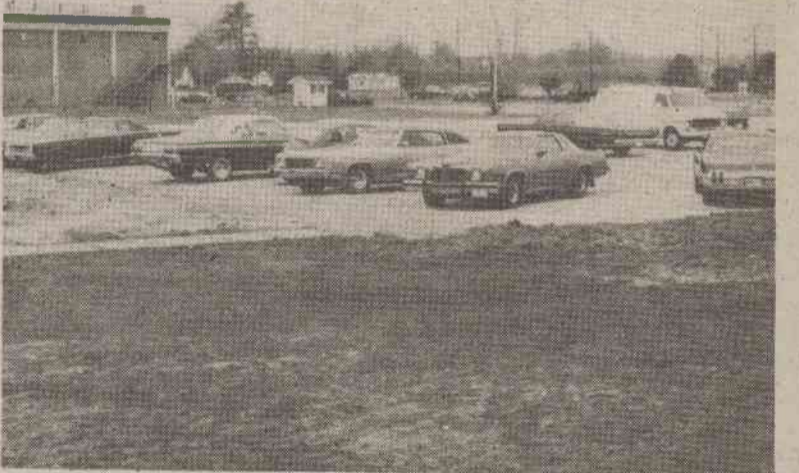
More Parking Space On Campus

The Sorors of Delta Theta Chapter of Alpha Kappa Alpha Sorority, Inc. would like to express deep appreciation and gratitude to the following organizations: Zeta Kappa Omega Chapter of Alpha Kappa Alpha Sorority, Inc., Alpha Phi Alpha, Kappa Alpha Psi and Omega Psi Phi Fraternities for the thoughtfulness and hard work in making their annual Pastel Ball a success.