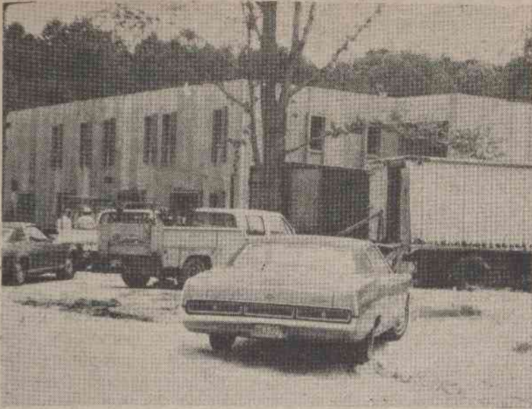
New industrial arts building beginning to take shape.