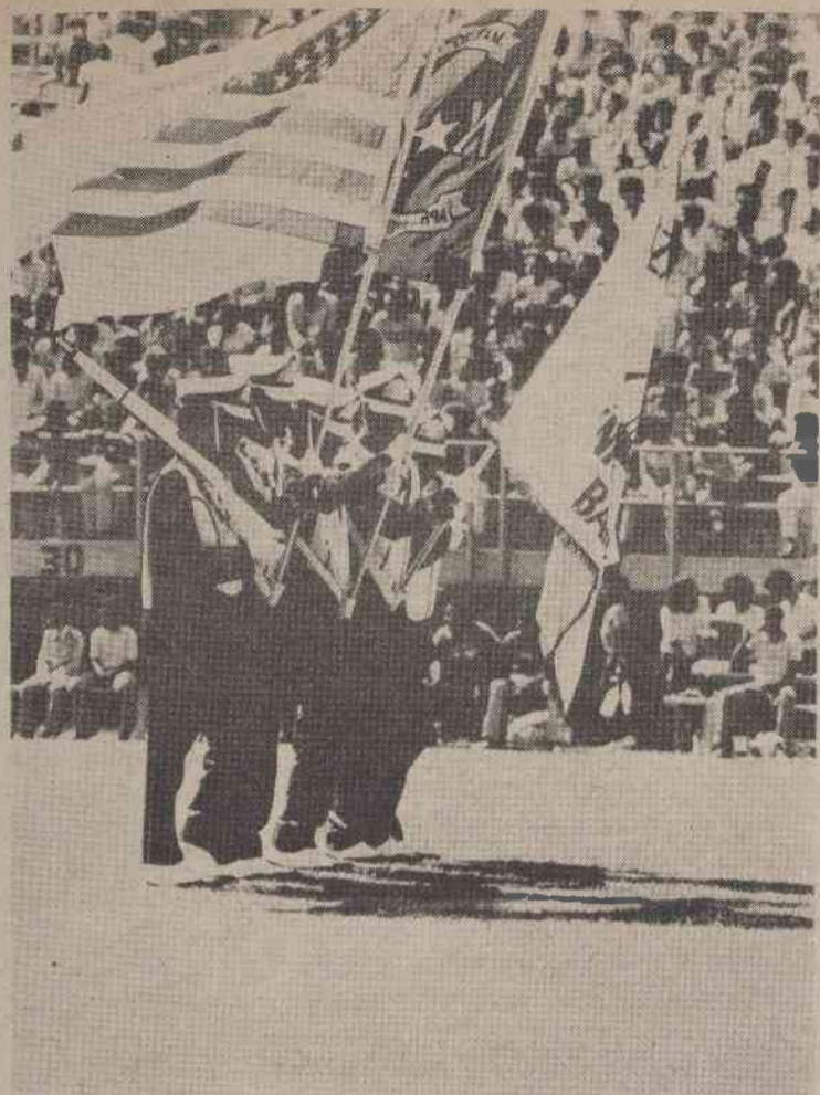
The New Color Guard

times a day beginning at 6:00 A. M. and ending about 9:00 P. M. During these days the practices consist of mostly running and getting into shape because there is not much time for this during class days. The practices are long and hard but in the end the members have shown its pride in their hearts to a great part of the Marching Viking Band.