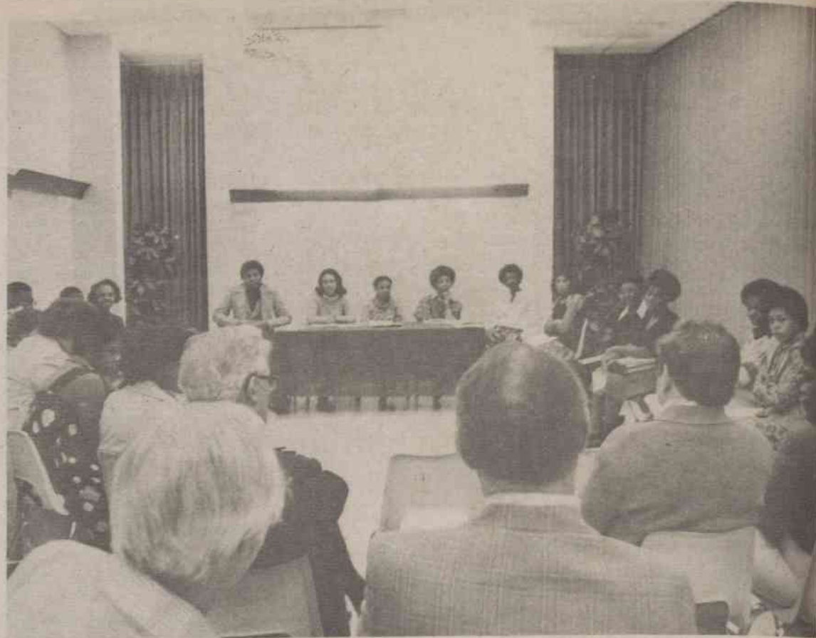
Senior Seminar Panel