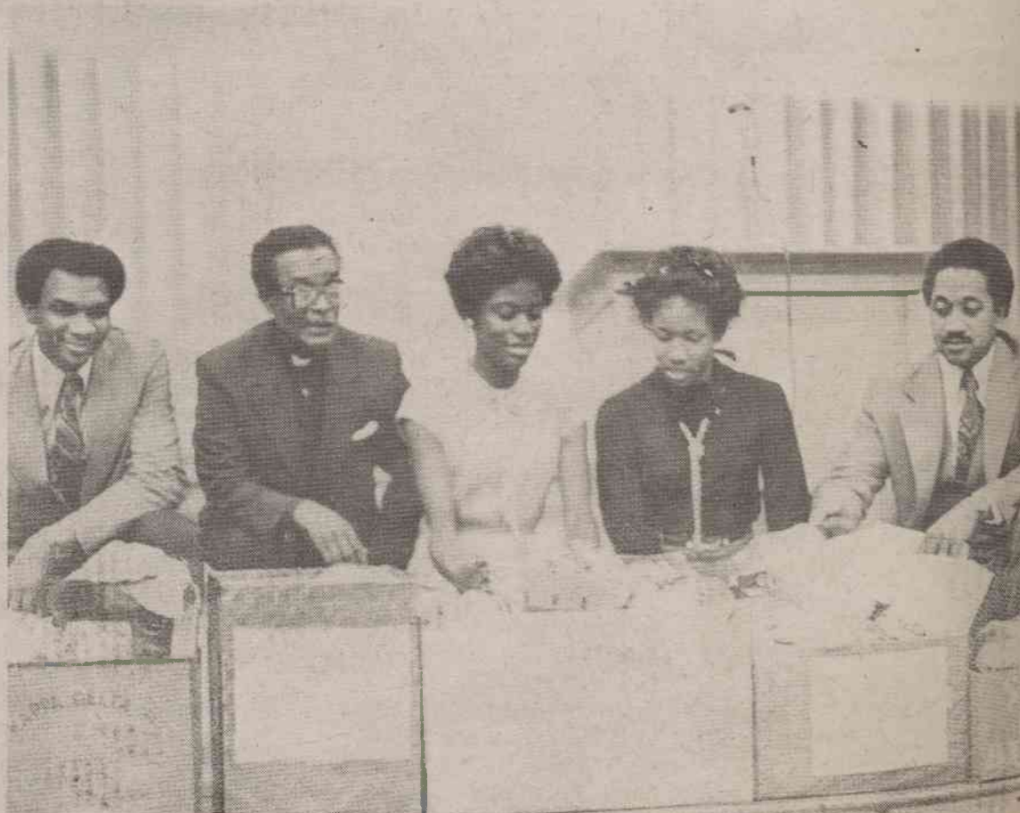
United Campus Religious Fellowship Sponsors Thanksgiving Vesper