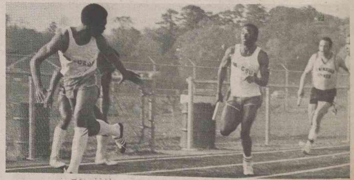
ECSU teammates edge their opponents in the 880-yd. relay.

Classrooms are no longer filled to their maximum capacity. The fever is upon us; that mystical allurment which draws one into its realm of speculation. Temperatures dictate change and four walls can no longer contain a wandering mind.