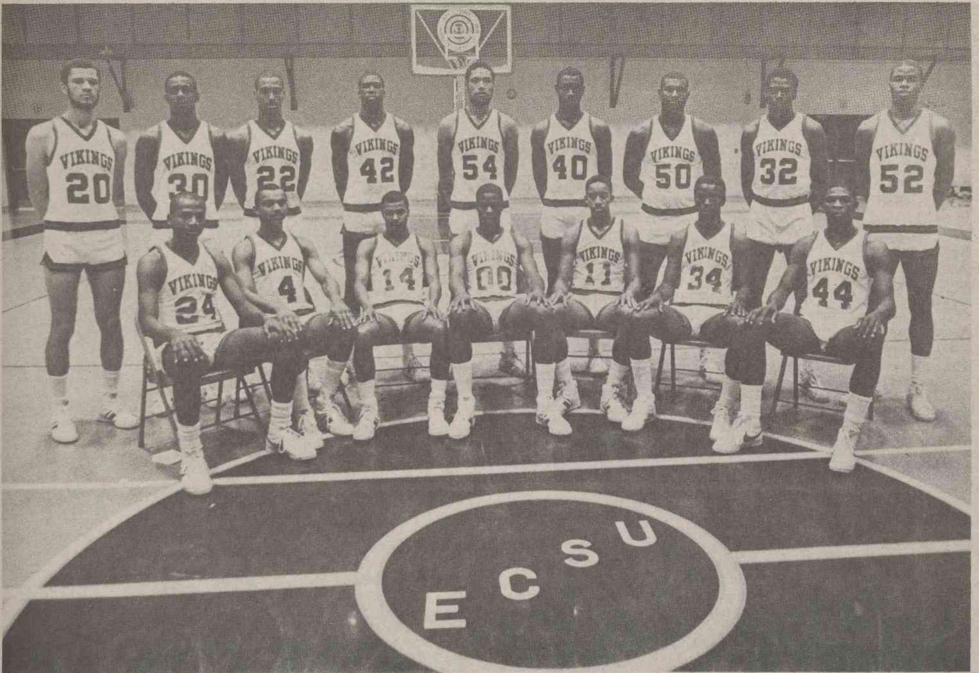
Viking 80-81 basketball team — shooting for a great season