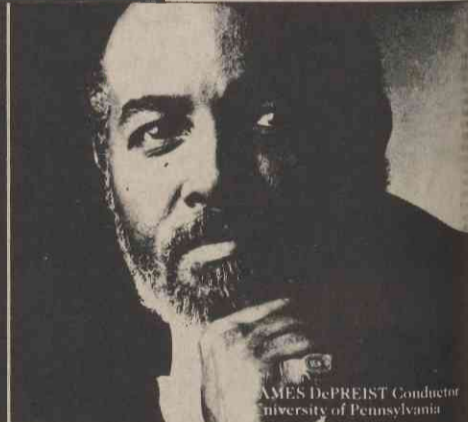
AMES DePREIST Conductor University of Pennsylvania