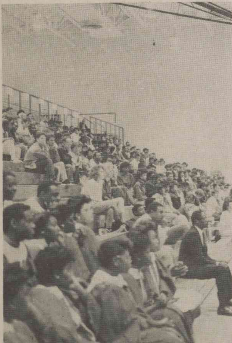
Students from 16 counties in Vaughn Center