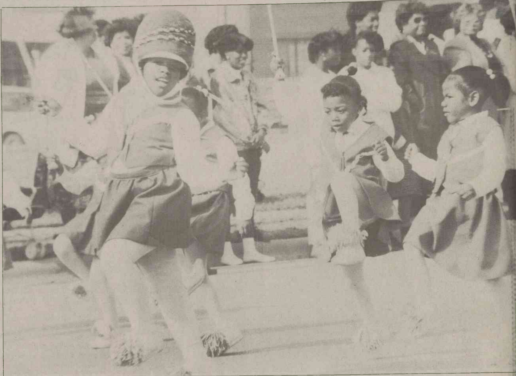
Members of the River City Marching Troop perform a high-stepping routine to the delight of the homecoming parade spectators.