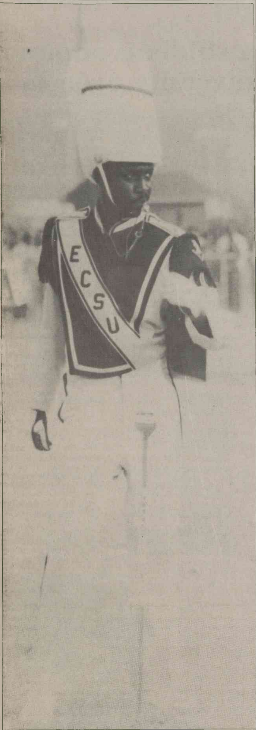
An ECSU drum major, one of the Three Amigos, leads the band during the homecoming halftime