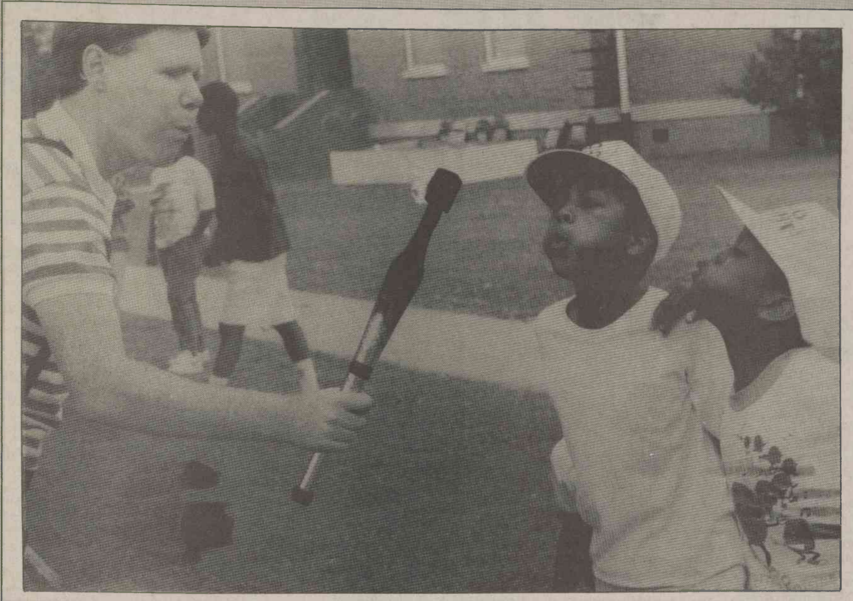
A professional juggler gets an extra huff-n-puff from two area youths at Viking Fest.