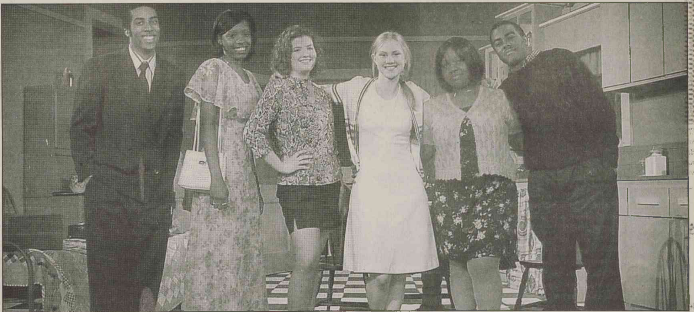
The Cast of Crimes of The Heart