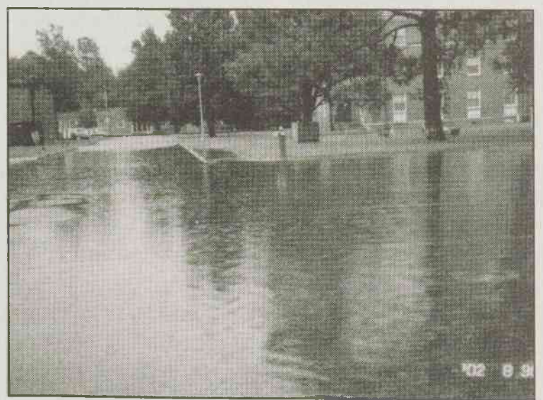
Who "Brock" the boat?