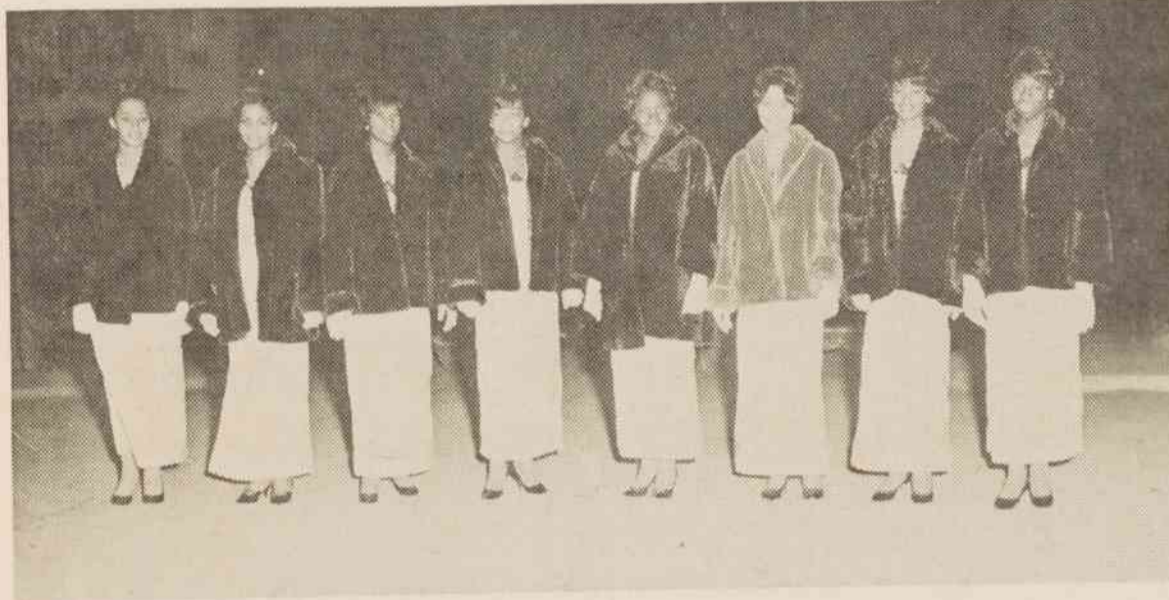
Alpha Kappa Alpha-Dolled in Pink and Green