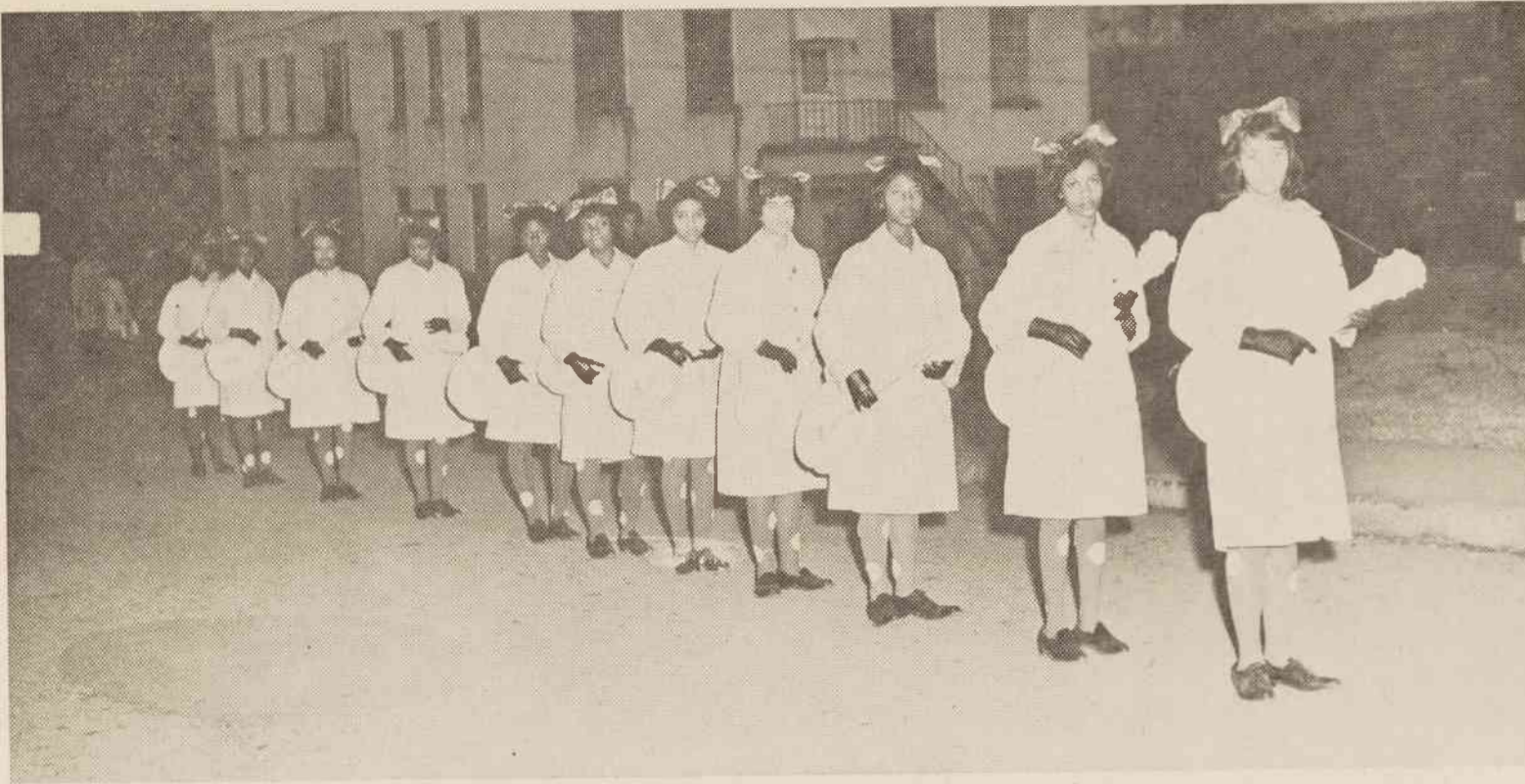
Shown Above: The Delta Sigma Theta Line