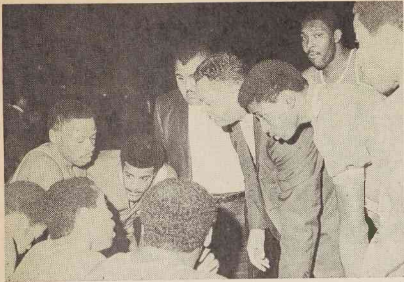
The Norfolk State tournament game — conference and action.