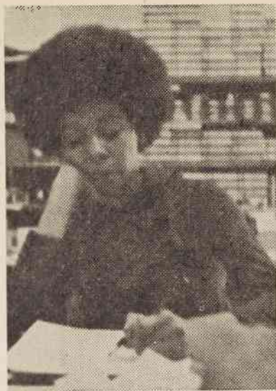
I am so tired.