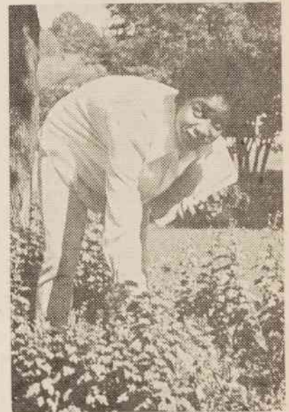
Oh! Shucks, I got caught!!