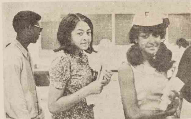
What does the "F" stand for?