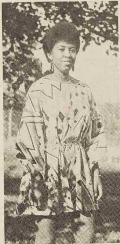
So what's it to you?