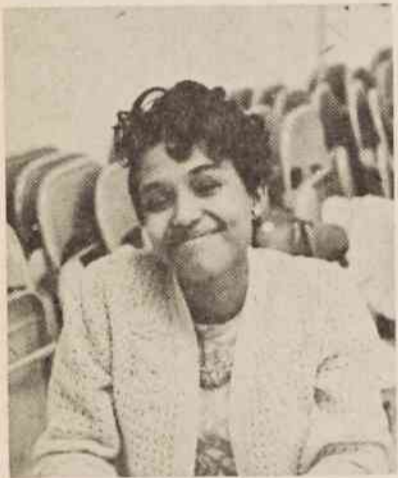
Smile, you are on campus-camera.