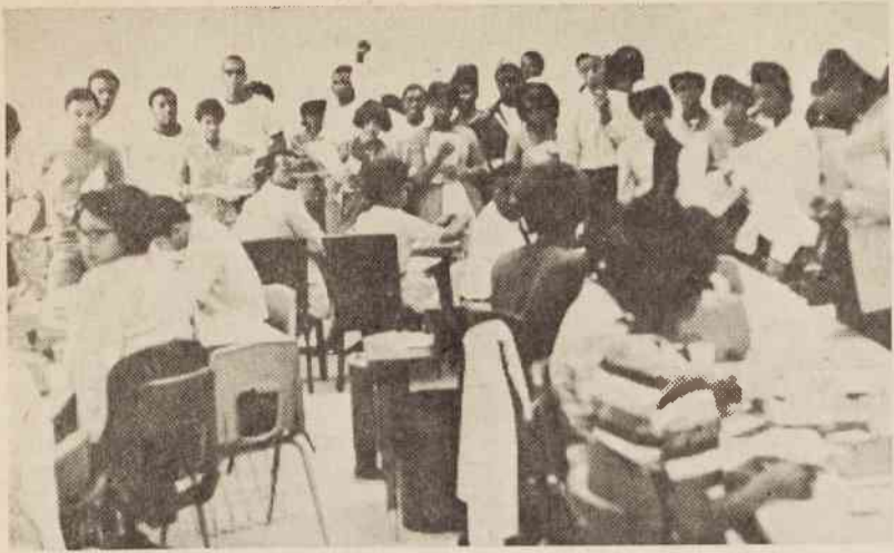
I will be glad when this day is over.