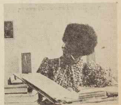
I really value an education.