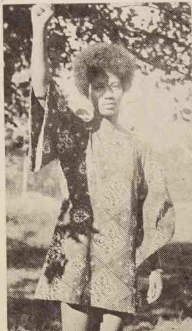
You got it sister, POWER!