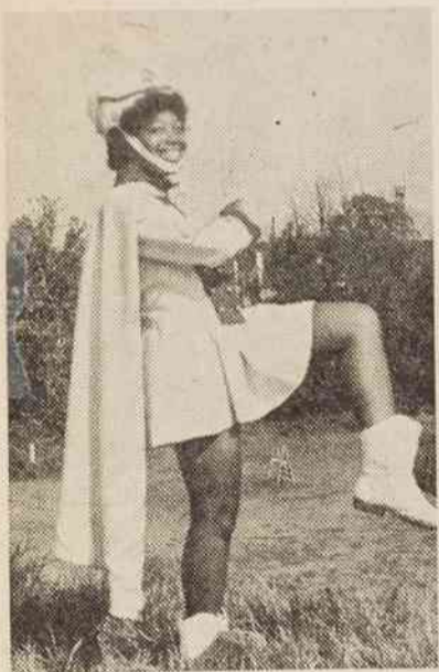
Shucks, I posed for this.