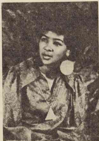
What are you talking about?