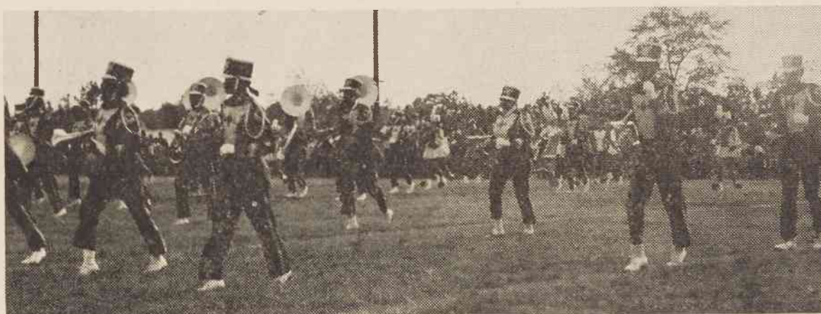
"Baddest" sound in the CIAA, doing their thing. (If only they were football players)