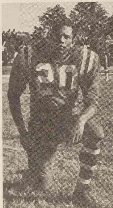
Wait until next year.