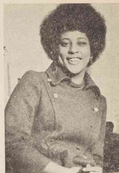
Daddy, Daddy! I had no cavities!