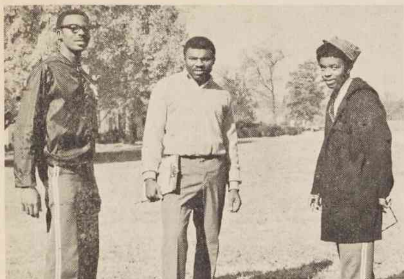
"Let's get a wine"