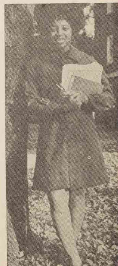
Hurry! The tree is falling.