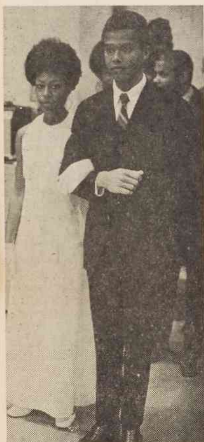
Stop shaking, brother.