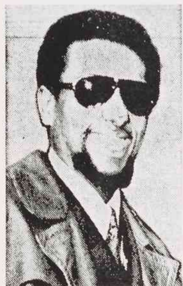
BRO. STOKELY CARMICHAEL

Stokely Carmichael and his wife, Miriam Makeba, both showing the signs of a strained series of speaking engagements, spent Saturday, April 12, in Baltimore delivering the message of Pan-Africanism (the world-wide unity of Black people) and warning of approaching genocide attempts from the American government.