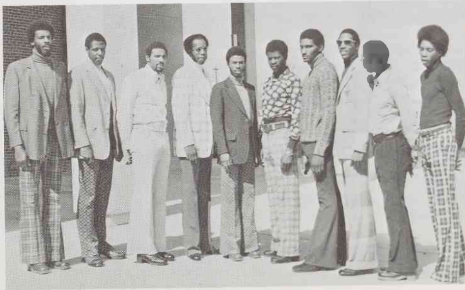
Snapshots of All CIAA Team