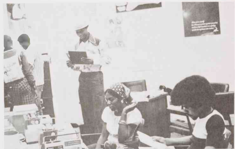
SGA at work.

speaking evil of others, and bears the responsibility of college life with dignity and grace, making the best of all circumstances.